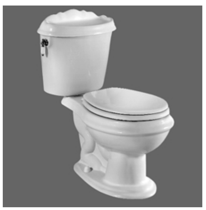
Shown with 5311.012 "Laurel" seat